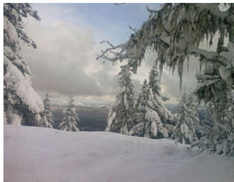
Overlooking Umpqua Valley

Some thoughts that keep bouncing around in my head are what kinds of hobbies or entertainment are most suited for the current economic climate. Again keeping it close to home seems to be the order of the day. Perhaps some painting or photography. Yes the economy is tough right now, but maybe that isn't so bad after all.