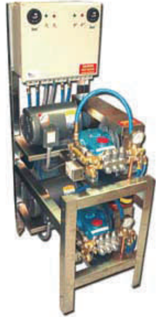
New car wash equipment we installed at Winston Carwash. Give them a try sometime, they work great and I'm certain they'd appreciate the business!

We're excited about the year to come, and hope that you have a happy and prosperous new year. We look forward to helping in any way we can.