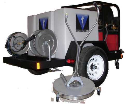
HydroTek's Nationally advertized special, this is a limited time offer!