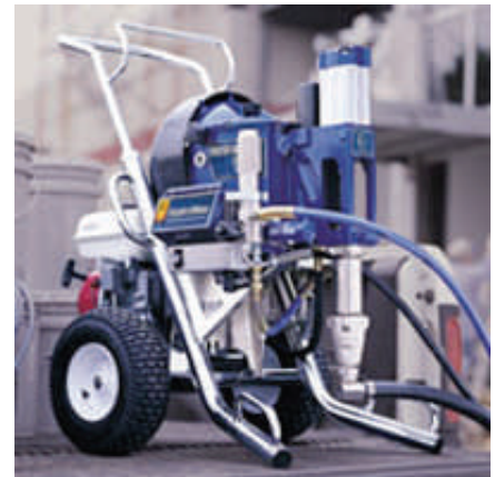
Will your equipment be operational this Spring?

Another possibility is a "classifieds" section where you may wish to list job openings, the need for a subcontractor for a job you have coming up or to list equipment you have for sale.