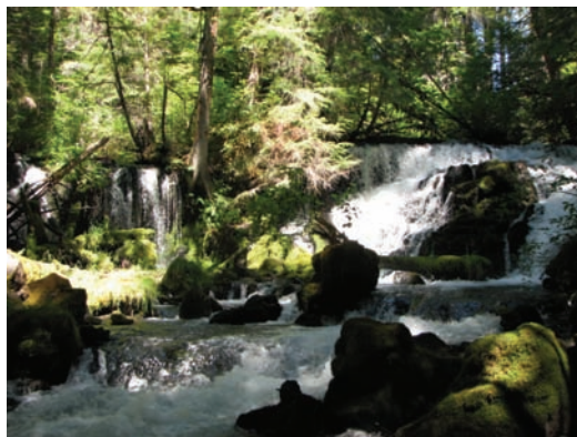
Pearsony Falls, Prospect Oregon (25 min. south of Crater Lake.)