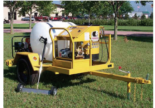
Weed eradication unit