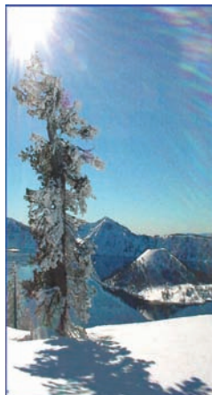
Crater Lake Oregon

Speaking of family sports, if you're looking for something to get the kids out of the house, and own a computer with internet access, an investment of another $100 or so into a portable GPS receiver can produce countless hours of outdoor entertain-