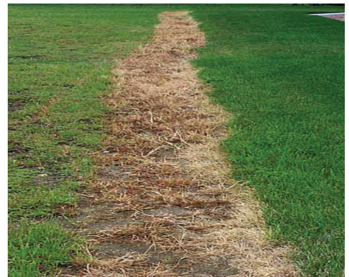
Chemical free weed control!