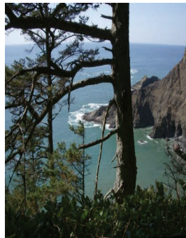
North Cape Flacon

If your luck is anything like ours, you've seen a lot of wet weather, but if you're like most, WOW, what a place! Riding in the dunes, camping galore, fishing the tributaries or fishing and crabbing in the bays, our coast has a lot to offer. Perhaps not the warm temperatures of southern California, but so many more opportunities for adventure. Our last foray took us to Depot Bay. It just so happened they were having a town wide "treasure hunt" and most locals were dressed for the occasion in pirate cos-