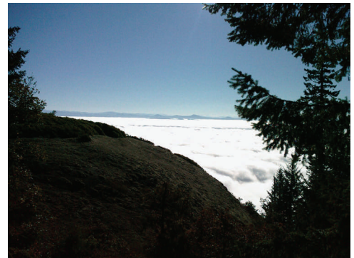
"A sea of clouds" another view from the top of the Callahans.

where they will. On the downside, loyalty amongst the companies is rare, they're all following the almighty dollar, and sales is king. Look for far more equipment manufactured in China and the associated issues such as parts availability. On the upside, the competition is breeding a rapid acceleration of technology into the equipment to stay ahead in the game. "Green" processes, cleaning compounds, and equipment are still making great strides as well.